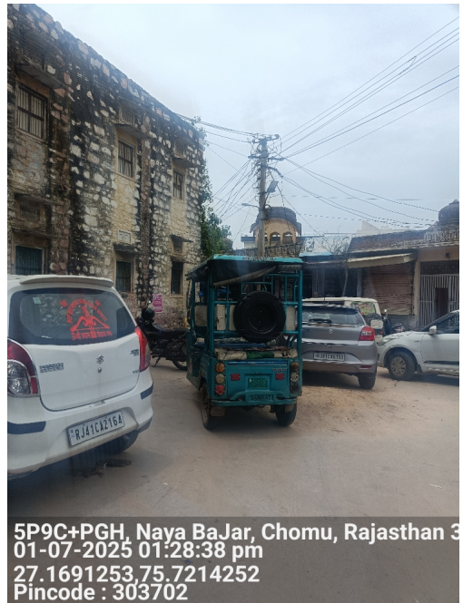
5P9C+PGH, Naya BaJar, Chomu, Rajasthan 3 01-07-2025 01:28:38 pm 27.1691253,75.7214252 Pincode : 303702