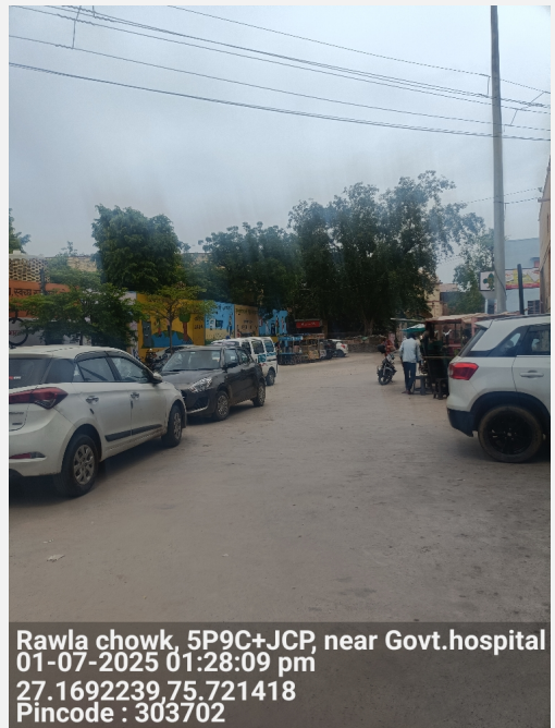
Rawla chowk, 5P9C+JCP, near Govt.hospital 01-07-2025 01:28:09 pm 27.1692239,75.721418 Pincode : 303702