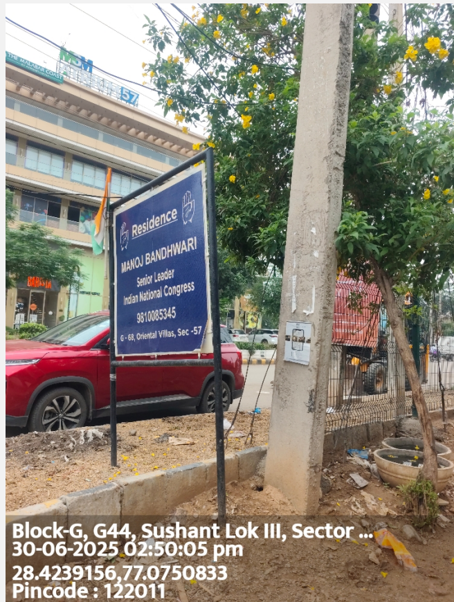
Block-G, G44, Sushant Lok III, Sector ... 30-06-2025 02:50:05 pm 28.4239156,77.0750833 Pincode : 122011

Shop front with horizontal view covering the left & right of the shop establishing if the shop is an individual structure, in a marketplace, highway, isolated place, in a cluster framework.