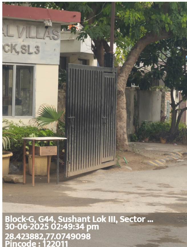
Block-G, G44, Sushant Lok III, Sector ... 30-06-2025 02:49:34 pm 28.423882,77.0749098 Pincode : 122011

Shop inside with inventory photos establishing that the inside is of the same shop where the front photo was taken