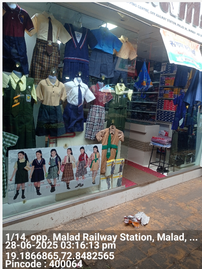
1/14, opp. Malad Railway Station, Malad, ... 28-06-2025 03:16:13 pm 19.1866865,72.8482565 Pincode : 400064

Shop front with horizontal view covering the left & right of the shop establishing if the shop is an individual structure, in a marketplace, highway, isolated place, in a cluster framework.