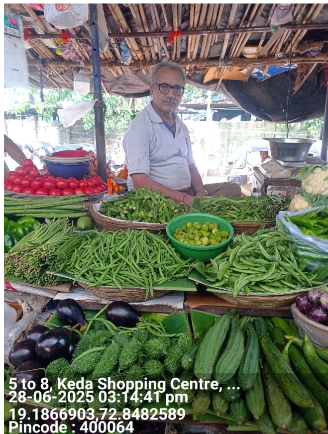
5 to 8, Keda Shopping Centre, ... 28-06-2025 03:14:41 pm 19.1866903,72.8482589 Pincode : 400064

Shop inside with inventory photos establishing that the inside is of the same shop where the front photo was taken