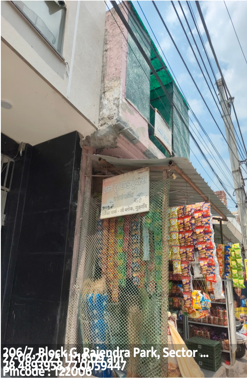
206/7, Block G, Rajendra Park, Sector ... 27-06-2025 11:18 AM 28-4893958-770059447 Pincode : 122008