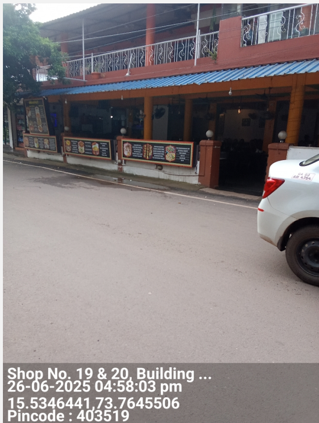
Shop No. 19 & 20, Building ... 26-06-2025 04:58:03 pm 15.5346441,73.7645506 Pincode : 403519

Shop front with horizontal view covering the left & right of the shop establishing if the shop is an individual structure, in a marketplace, highway, isolated place, in a cluster framework.