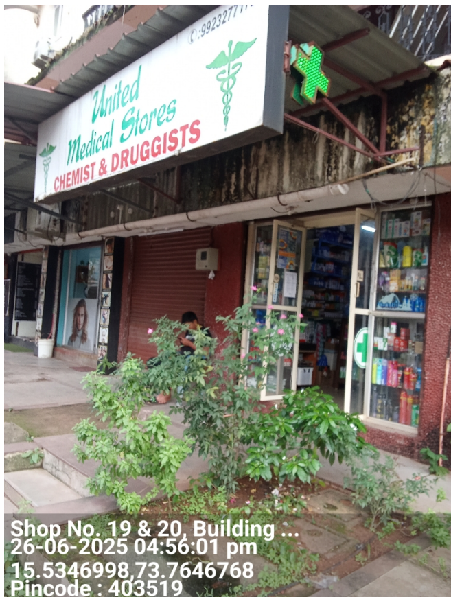
Shop No. 19 & 20, Building ... 26-06-2025 04:56:01 pm 15.5346998,73.7646768 Pincode : 403519

Shop inside with inventory photos establishing that the inside is of the same shop where the front photo was taken