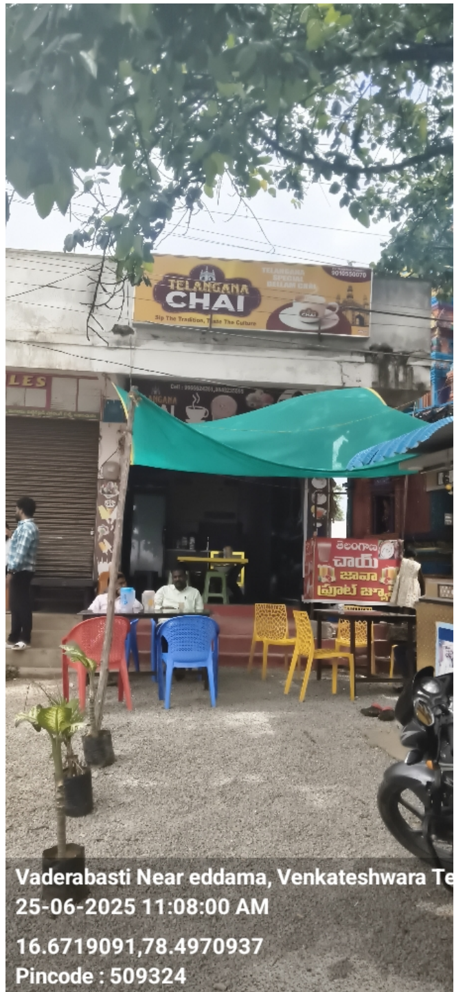
Vaderabasti Near eddama, Venkateshwara Te 25-06-2025 11:08:00 AM 16.6719091,78.4970937 Pincode : 509324

Shop front photo with full vertical viewpoint i.e; shop board, sealing, entrance, ground on which the shop is established (cemented, pilers, bricks, stands, mud, wheels etc.)