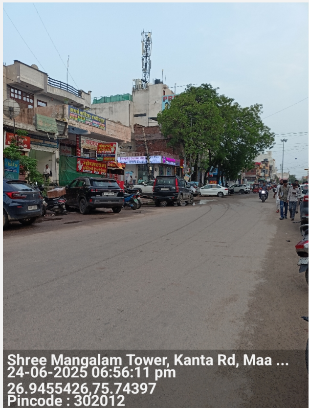
Shree Mangalam Tower, Kanta Rd, Maa ... 24-06-2025 06:56:11 pm 26.9455426,75.74397 Pincode : 302012