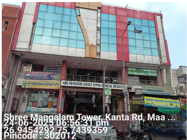
Shree Mangalam Tower, Kanta Rd, Maa ... 24-06-2025 06:56:31 pm 26.9454292,75.7439359 Pincode : 302012