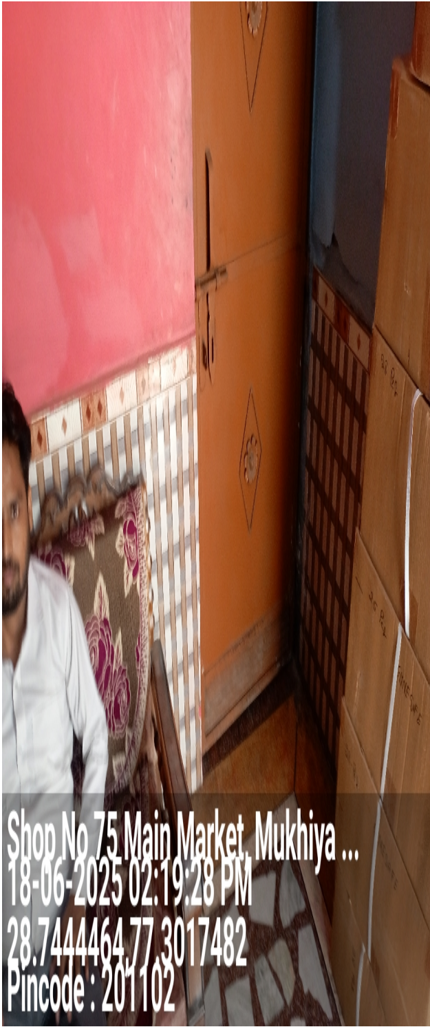
Office setup with employees

Shop No 75 Main Market, Mukhiya ... 18-06-2025 02:19:28 PM 28.7444464, 77.3017482 Pincode : 201102