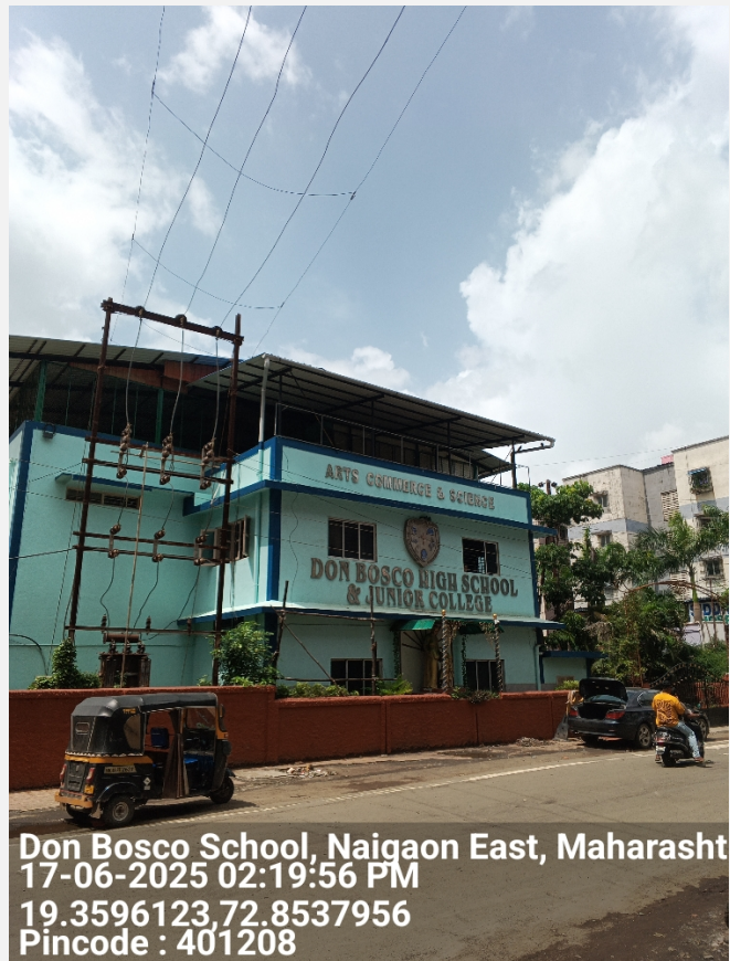
Don Bosco School, Naigaon East, Maharashtra 17-06-2025 02:19:56 PM 19.3596123,72.8537956 Pincode : 401208

Shop front photo with full vertical viewpoint i.e; shop board, sealing, entrance, ground on which the shop is established (cemented, pilers, bricks, stands, mud, wheels etc.)