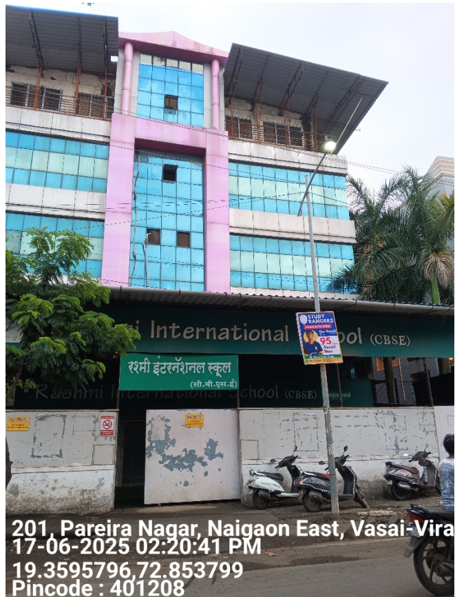
201, Pareira Nagar, Naigaon East, Vasai-Virar 17-06-2025 02:20:41 PM 19.3595796,72.853799 Pincode : 401208

Take Photo of Person Met Inside the Shop