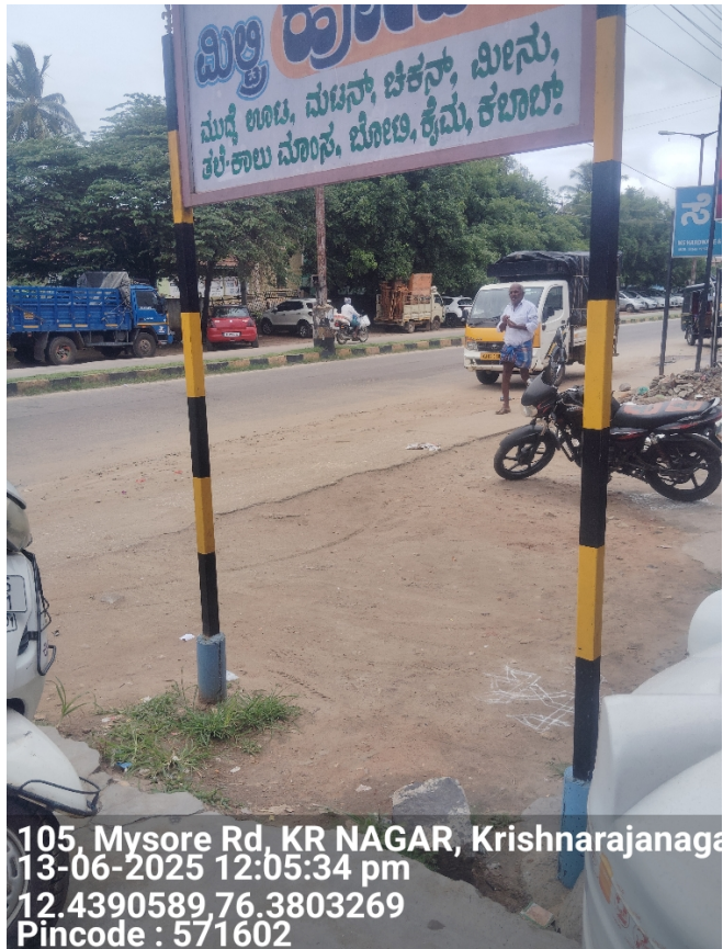
105, Mysore Rd, KR NAGAR, Krishnarajanagar 13-06-2025 12:05:34 pm 12.4390589 76.3803269 Pincode : 571602

Shop inside with inventory photos establishing that the inside is of the same shop where the front photo was taken