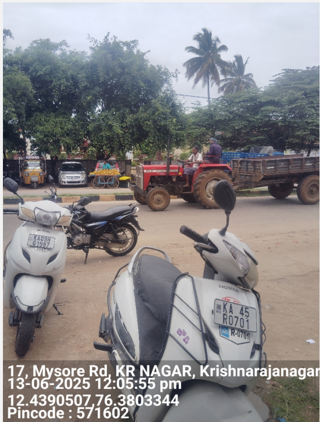
17, Mysore Rd, KR NAGAR, Krishnarajanagar 13-06-2025 12:05:55 pm 12.4390507 76.3803344 Pincode : 571602

Shop front with horizontal view covering the left & right of the shop establishing if the shop is an individual structure, in a marketplace, highway, isolated place, in a cluster framework.