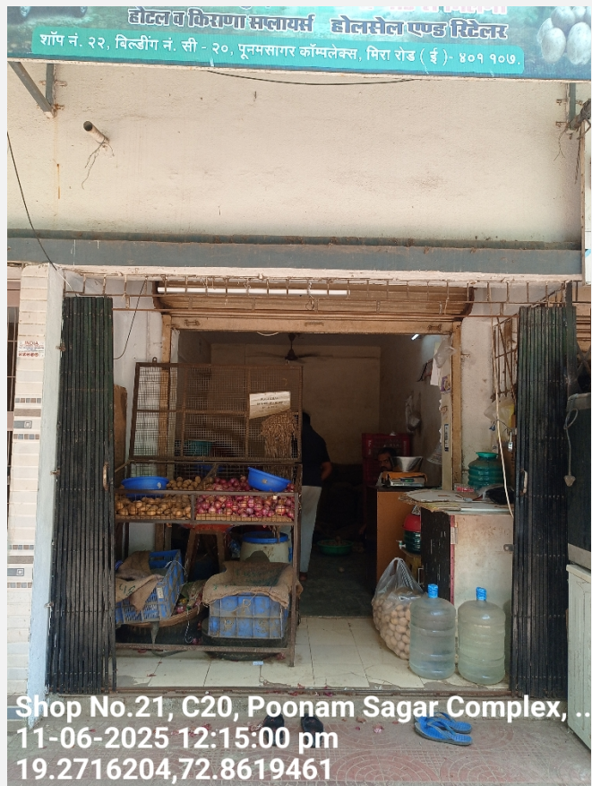
Shop No.21, C20, Poonam Sagar Complex, .. 11-06-2025 12:15:00 pm 19.2716204,72.8619461

Shop front photo with full vertical viewpoint i.e; shop board, sealing, entrance, ground on which the shop is established (cemented, pilers, bricks, stands, mud, wheels etc.)