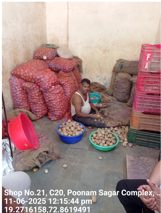
Shop No.21, C20, Poonam Sagar Complex, .. 11-06-2025 12:15:44 pm 19.2716158,72.8619491

Take Photo of Person Met Inside the Shop