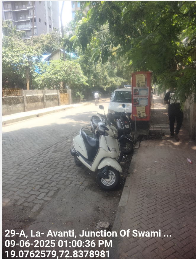
29-A, La- Avanti, Junction Of Swami ... 09-06-2025 01:00:36 PM 19.0762579,72.8378981