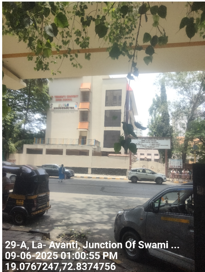
29-A, La- Avanti, Junction Of Swami ... 09-06-2025 01:00:55 PM 19.0767247,72.8374756