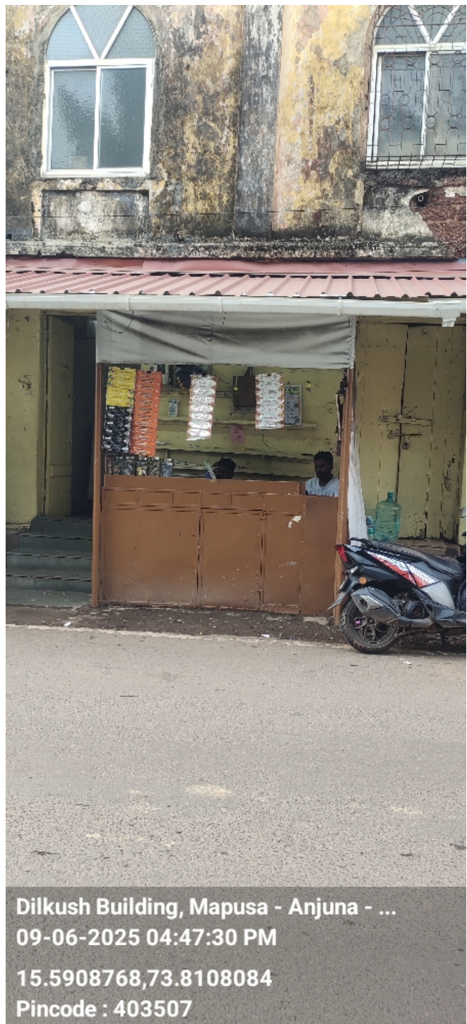
Dilkush Building, Mapusa - Anjuna - ... 09-06-2025 04:47:30 PM 15.5908768,73.8108084 Pincode : 403507

Shop front photo with full vertical viewpoint i.e; shop board, sealing, entrance, ground on which the shop is established (cemented, pilers, bricks, stands, mud, wheels etc.)