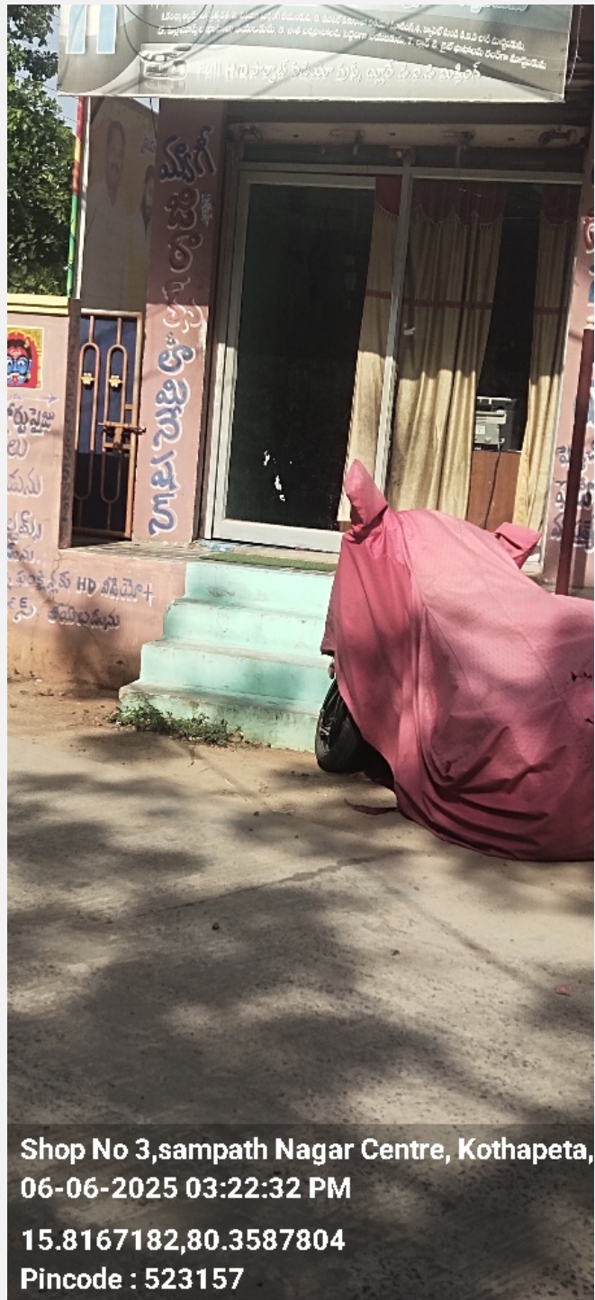
Shop No 3,sampath Nagar Centre, Kothapeta, 06-06-2025 03:22:32 PM 15.8167182,80.3587804 Pincode : 523157

Shop front with horizontal view covering the left & right of the shop establishing if the shop is an individual structure, in a marketplace, highway, isolated place, in a cluster framework.