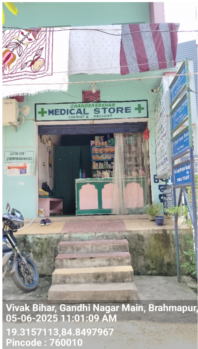
Vivak Bihar, Gandhi Nagar Main, Brahmapur, 05-06-2025 11:01:09 AM 19.3157113,84.8497967 Pincode : 760010

Shop front with horizontal view covering the left & right of the shop establishing if the shop is an individual structure, in a marketplace, highway, isolated place, in a cluster framework.