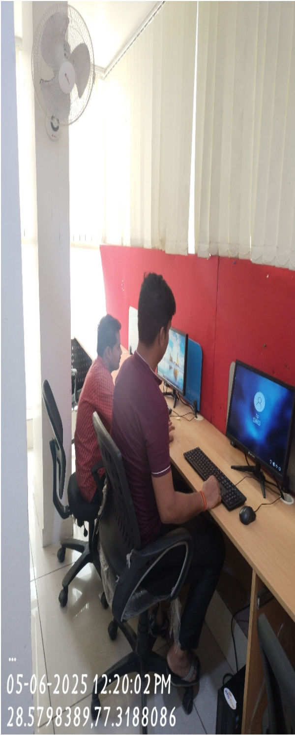
Office setup with employees