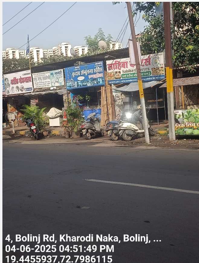
4, Bolinj Rd, Kharodi Naka, Bolinj, ... 04-06-2025 04:51:49 PM 19.4455937,72.7986115

Take Photo of Person Met Inside the Shop