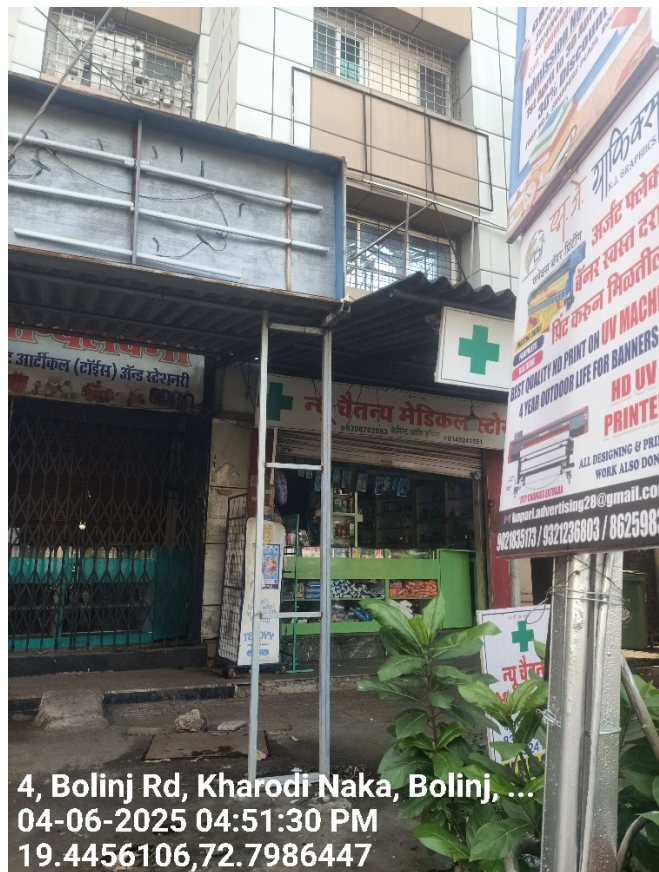
4, Bolinj Rd, Kharodi Naka, Bolinj, ... 04-06-2025 04:51:30 PM 19.4456106,72.7986447

Shop front photo with full vertical viewpoint i.e; shop board, sealing, entrance, ground on which the shop is established (cemented, pilers, bricks, stands, mud, wheels etc.)