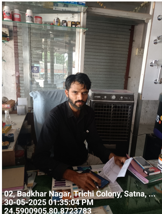
02, Badkhar Nagar, Trichi Colony, Satna, ... 30-05-2025 01:35:04 PM 24.5900905,80.8723783

Take Photo of Person Met Inside the Shop