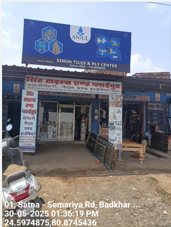
01, Satna - Semariya Rd, Badkhar ... 30-05-2025 01:36:19 PM 24.5974875,80.8745436

Shop front photo with full vertical viewpoint i.e; shop board, sealing, entrance, ground on which the shop is established (cemented, pilers, bricks, stands, mud, wheels etc.)