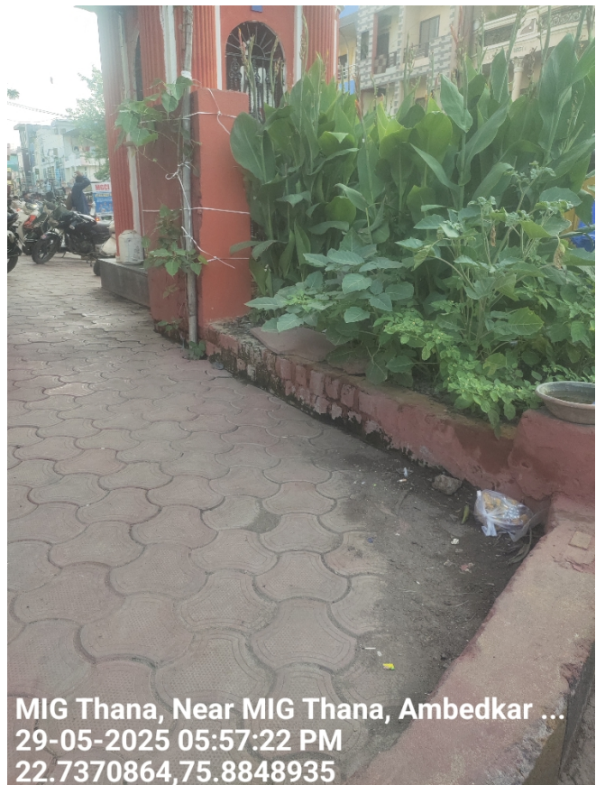
MIG Thana, Near MIG Thana, Ambedkar ... 29-05-2025 05:57:22 PM 22.7370864,75.8848935

Shop inside with inventory photos establishing that the inside is of the same shop where the front photo was taken