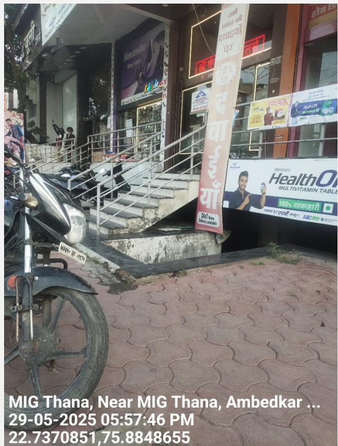
MIG Thana, Near MIG Thana, Ambedkar ... 29-05-2025 05:57:46 PM 22.7370851,75.8848655

Shop front with horizontal view covering the left & right of the shop establishing if the shop is an individual structure, in a marketplace, highway, isolated place, in a cluster framework.