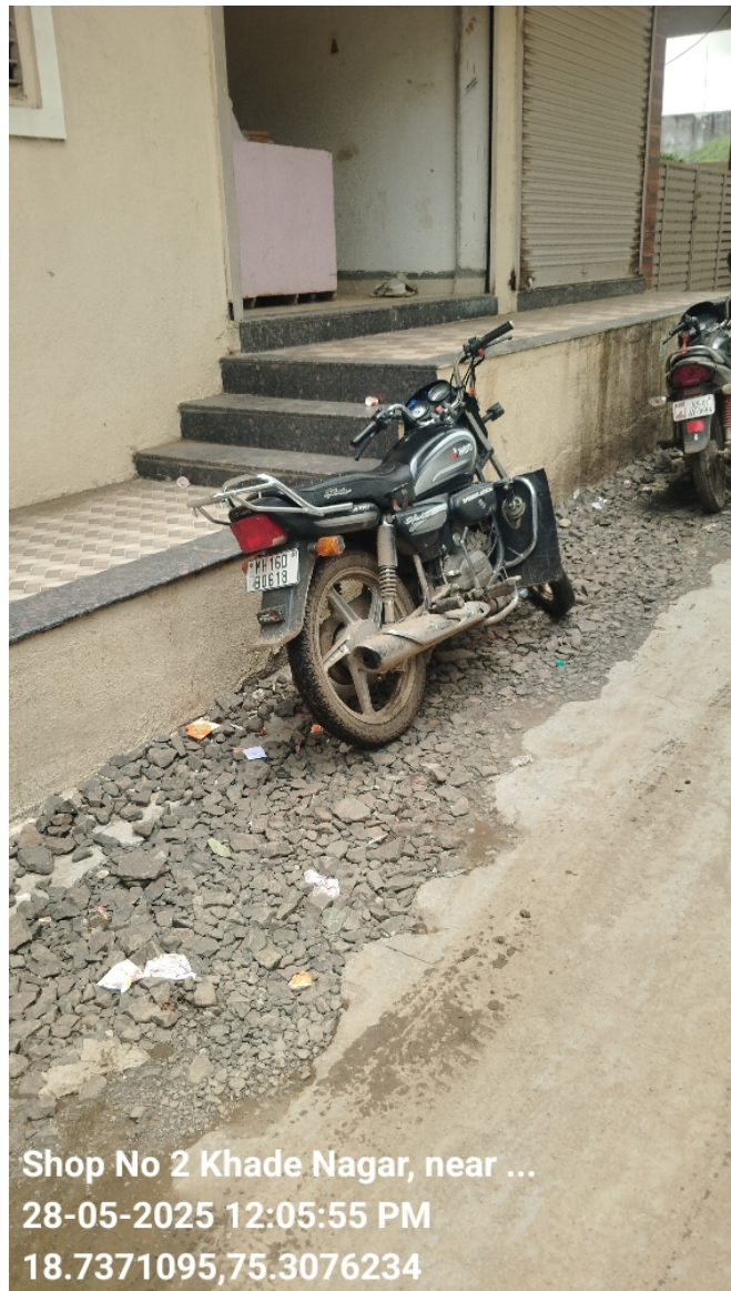
Shop No 2 Khade Nagar, near ... 28-05-2025 12:05:55 PM 18.7371095,75.3076234

Shop front photo with full vertical viewpoint i.e; shop board, sealing, entrance, ground on which the shop is established (cemented, pilers, bricks, stands, mud, wheels etc.)