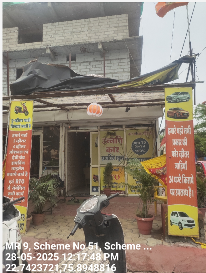
MR 9, Scheme No 51, Scheme ... 28-05-2025 12:17:48 PM 22.7423721,75.8948816

Shop front photo with full vertical viewpoint i.e; shop board, sealing, entrance, ground on which the shop is established (cemented, pilers, bricks, stands, mud, wheels etc.)