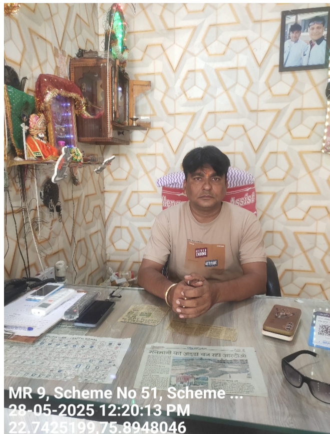
MR 9, Scheme No 51, Scheme ... 28-05-2025 12:20:13 PM 22.7425199,75.8948046

Take Photo of Person Met Inside the Shop