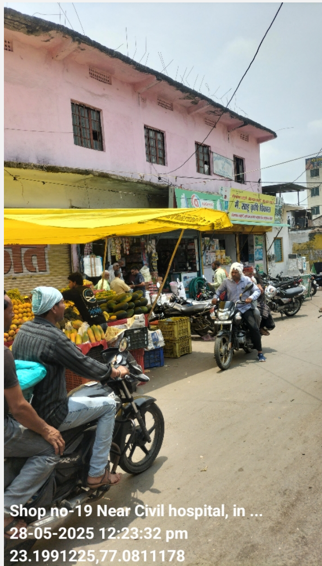
Shop no-19 Near Civil hospital, in ... 28-05-2025 12:23:32 pm 23.1991225,77.0811178

Take Photo of Person Met Inside the Shop