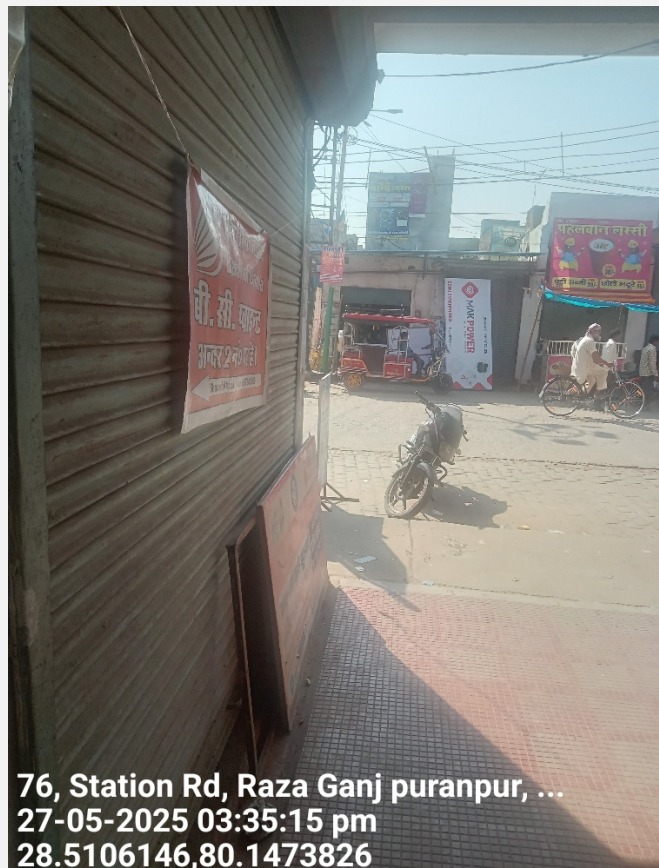
76, Station Rd, Raza Ganj puranpur, ... 27-05-2025 03:35:15 pm 28.5106146,80.1473826

Take Photo of Person Met Inside the Shop