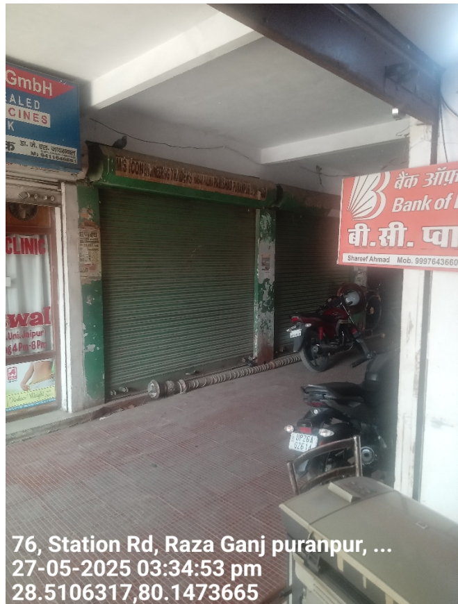
76, Station Rd, Raza Ganj puranpur, ... 27-05-2025 03:34:53 pm 28.5106317,80.1473665

Shop front photo with full vertical viewpoint i.e; shop board, sealing, entrance, ground on which the shop is established (cemented, pilers, bricks, stands, mud, wheels etc.)