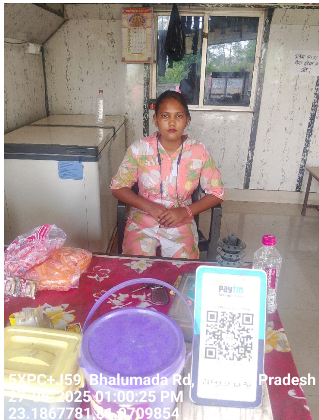
5XPC+J59, Bhalumada Rd, ... Pradesh 27-05-2025 01:00:25 PM 23.1867781,81.9709854

Take Photo of Person Met Inside the Shop