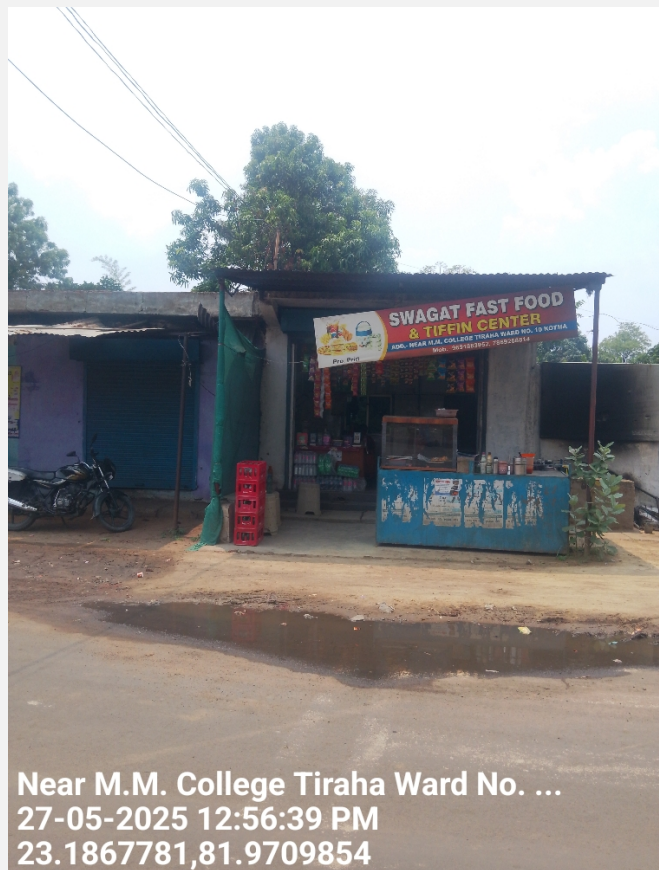
Near M.M. College Tiraha Ward No. ... 27-05-2025 12:56:39 PM 23.1867781,81.9709854

Shop front photo with full vertical viewpoint i.e; shop board, sealing, entrance, ground on which the shop is established (cemented, pilers, bricks, stands, mud, wheels etc.)