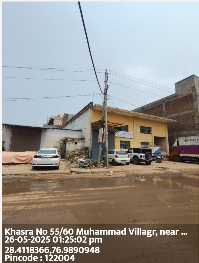
Khasra No 55/60 Muhammad Villagr, near ... 26-05-2025 01:25:02 pm 28.4118366,76.9890948 Pincode : 122004

Shop front with horizontal view covering the left & right of the shop establishing if the shop is an individual structure, in a marketplace, highway, isolated place, in a cluster framework.