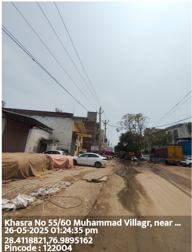
Khasra No 55/60 Muhammad Villagr, near ... 26-05-2025 01:24:35 pm 28.4118821,76.9895162 Pincode : 122004

Shop inside with inventory photos establishing that the inside is of the same shop where the front photo was taken