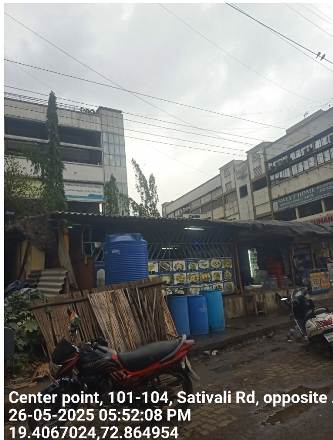
Center point, 101-104, Sativali Rd, opposite 26-05-2025 05:52:08 PM 19.4067024,72.864954

Shop inside with inventory photos establishing that the inside is of the same shop where the front photo was taken