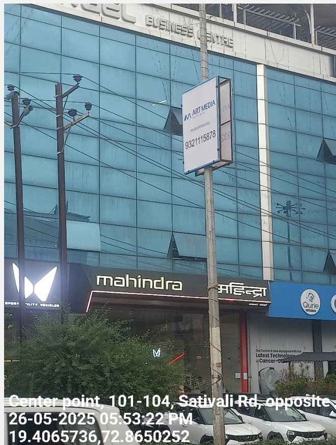
Center point, 101-104, Sativali Rd, opposite 26-05-2025 05:53:22 PM 19.4065736,72.8650252

Shop front with horizontal view covering the left & right of the shop establishing if the shop is an individual structure, in a marketplace, highway, isolated place, in a cluster framework.