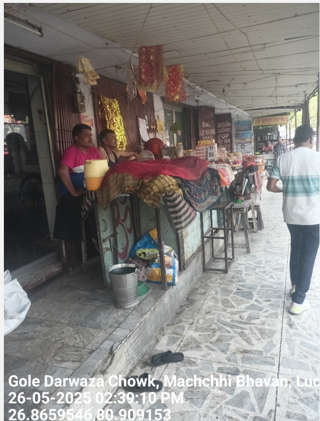
Gole Darwaza Chowk, Machchhi Bhavan, Luc 26-05-2025 02:39:10 PM 26.8659546,80.909153

Take Photo of Person Met Inside the Shop