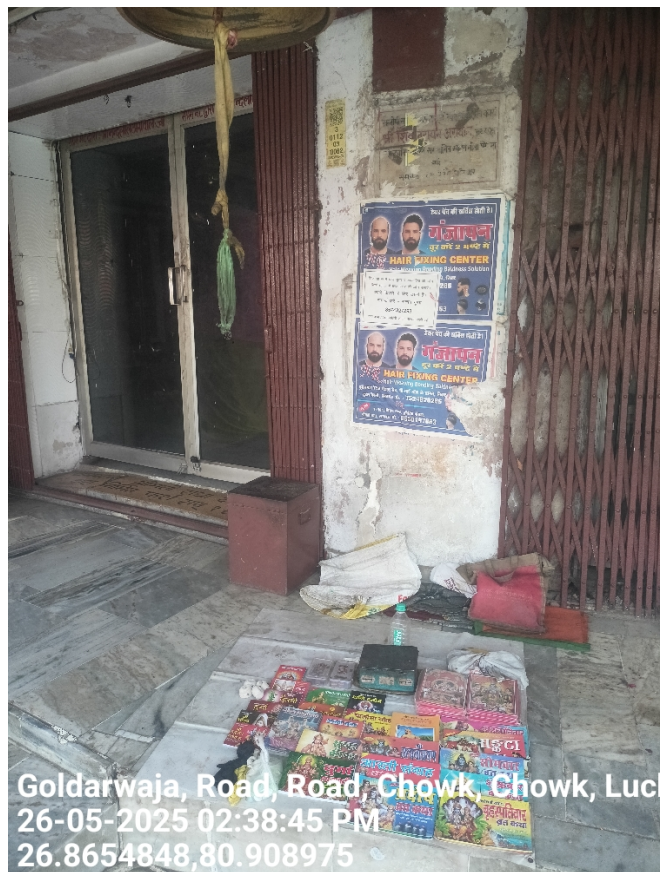
Goldarwaja, Road, Road, Chowk Chowk, Luc 26-05-2025 02:38:45 PM 26.8654848,80.908975

Shop front photo with full vertical viewpoint i.e; shop board, sealing, entrance, ground on which the shop is established (cemented, pilers, bricks, stands, mud, wheels etc.)