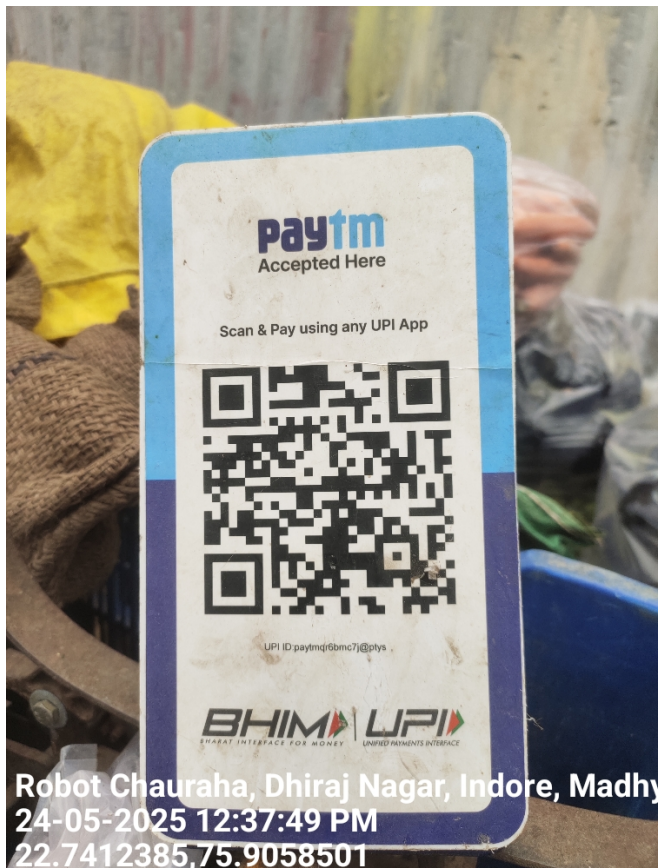
Robot Chauraha, Dhiraj Nagar, Indore, Madhya Pradesh 24-05-2025 12:37:49 PM 22.7412385,75.9058501

Take Photo of QR Code/Soundbox/EDC Machine