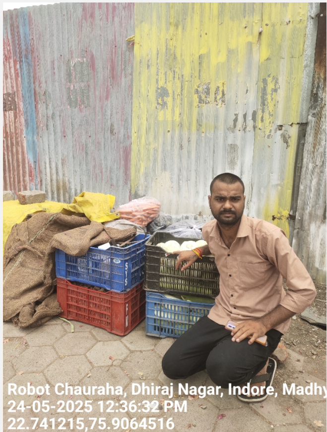
Robot Chauraha, Dhiraj Nagar, Indore, Madhya Pradesh 24-05-2025 12:36:32 PM 22.741215,75.9064516

Take Photo of Person Met Inside the Shop