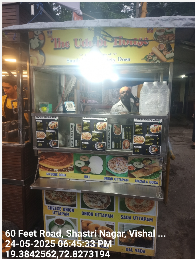
60 Feet Road, Shastri Nagar, Vishal ... 24-05-2025 06:45:33 PM 19.3842562,72.8273194

Shop front photo with full vertical viewpoint i.e; shop board, sealing, entrance, ground on which the shop is established (cemented, pilers, bricks, stands, mud, wheels etc.)