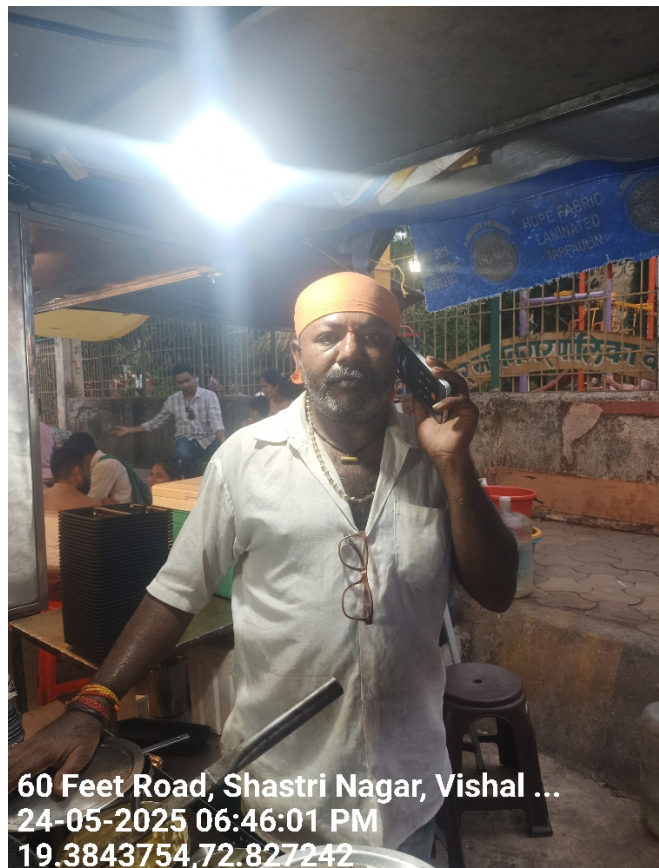
60 Feet Road, Shastri Nagar, Vishal ... 24-05-2025 06:46:01 PM 19.3843754,72.827242

Take Photo of Person Met Inside the Shop