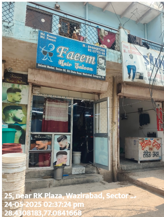
25, near RK Plaza, Wazirabad, Sector ... 24-05-2025 02:37:24 pm 28.4308183,77.0841668

Shop front with horizontal view covering the left & right of the shop establishing if the shop is an individual structure, in a marketplace, highway, isolated place, in a cluster framework.