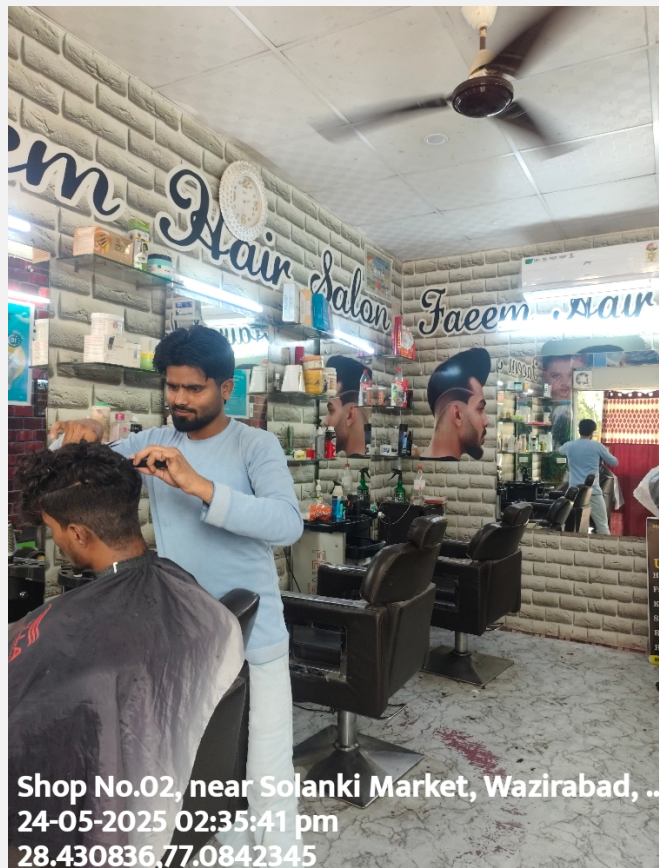
Shop No.02, near Solanki Market, Wazirabad, ... 24-05-2025 02:35:41 pm 28.430836,77.0842345

Shop inside with inventory photos establishing that the inside is of the same shop where the front photo was taken