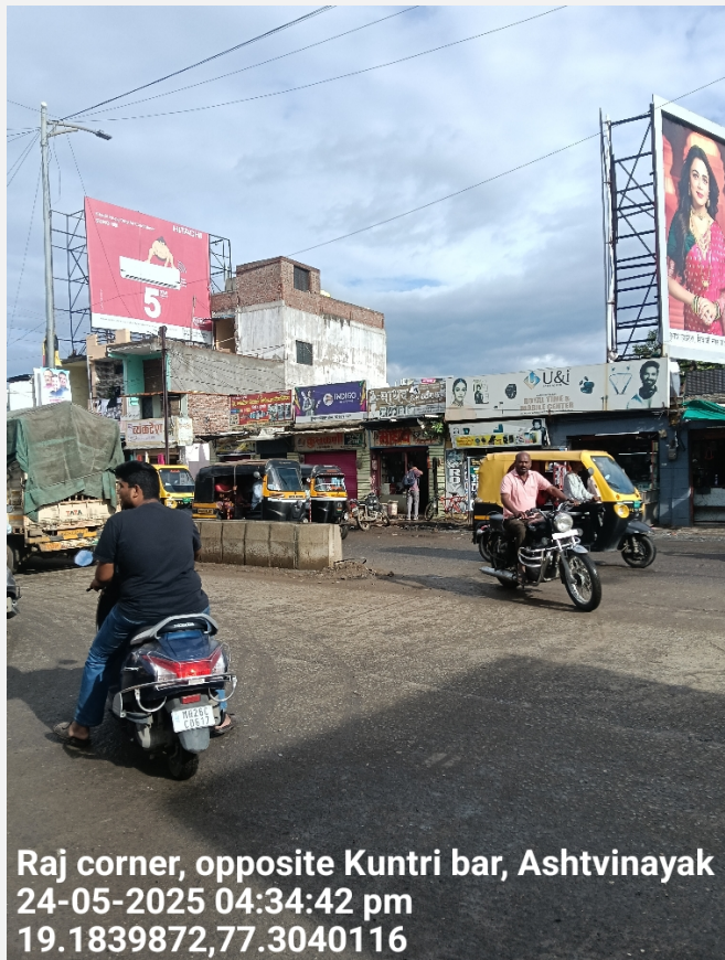
Raj corner, opposite Kuntri bar, Ashtvinayak 24-05-2025 04:34:42 pm 19.1839872,77.3040116