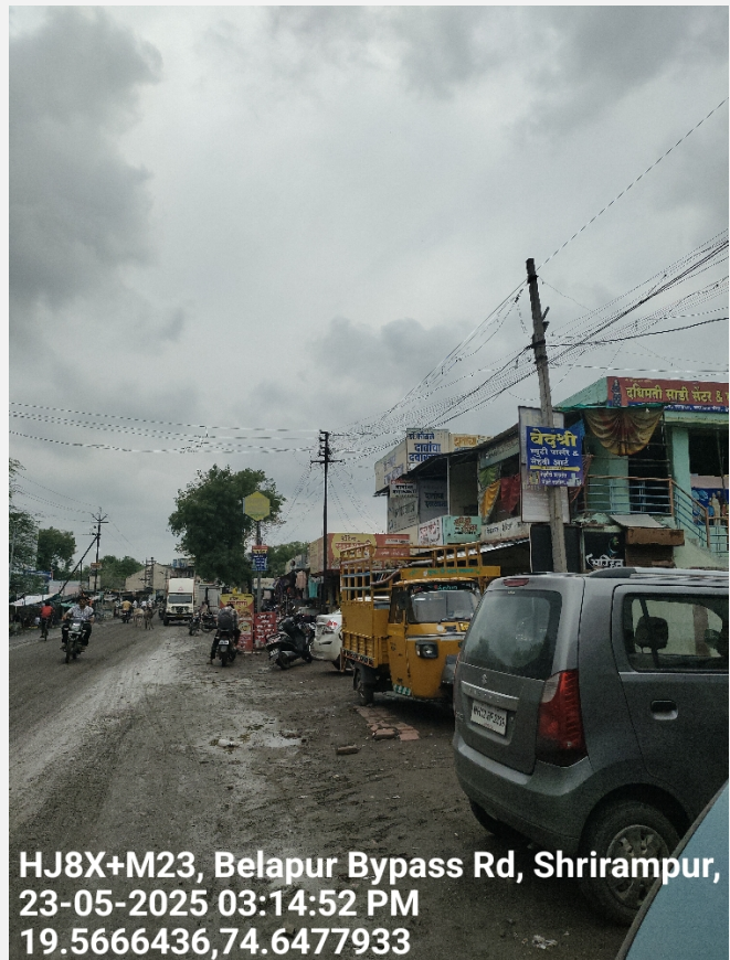
HJ8X+M23, Belapur Bypass Rd, Shrirampur, 23-05-2025 03:14:52 PM 19.5666436,74.6477933

Take Photo of Person Met Inside the Shop