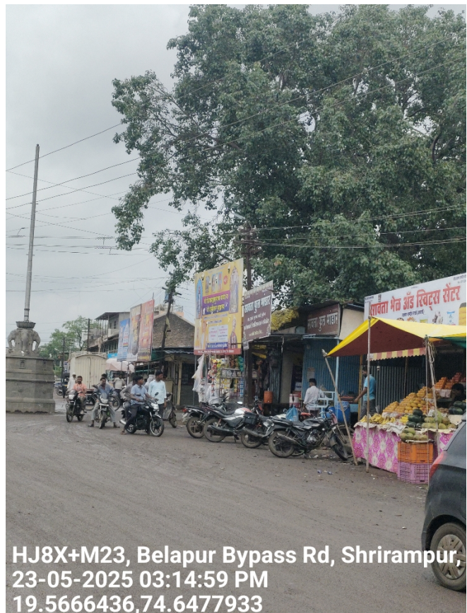
HJ8X+M23, Belapur Bypass Rd, Shrirampur, 23-05-2025 03:14:59 PM 19.5666436,74.6477933

Take Photo of QR Code/Soundbox/EDC Machine