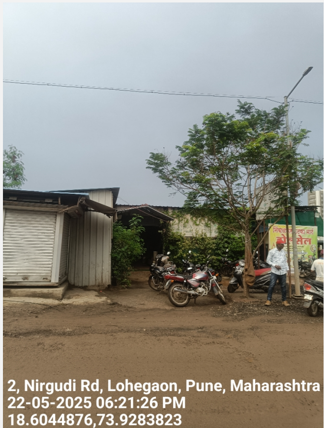
2, Nirgudi Rd, Lohegaon, Pune, Maharashtra 22-05-2025 06:21:26 PM 18.6044876,73.9283823

Shop front with horizontal view covering the left & right of the shop establishing if the shop is an individual structure, in a marketplace, highway, isolated place, in a cluster framework.