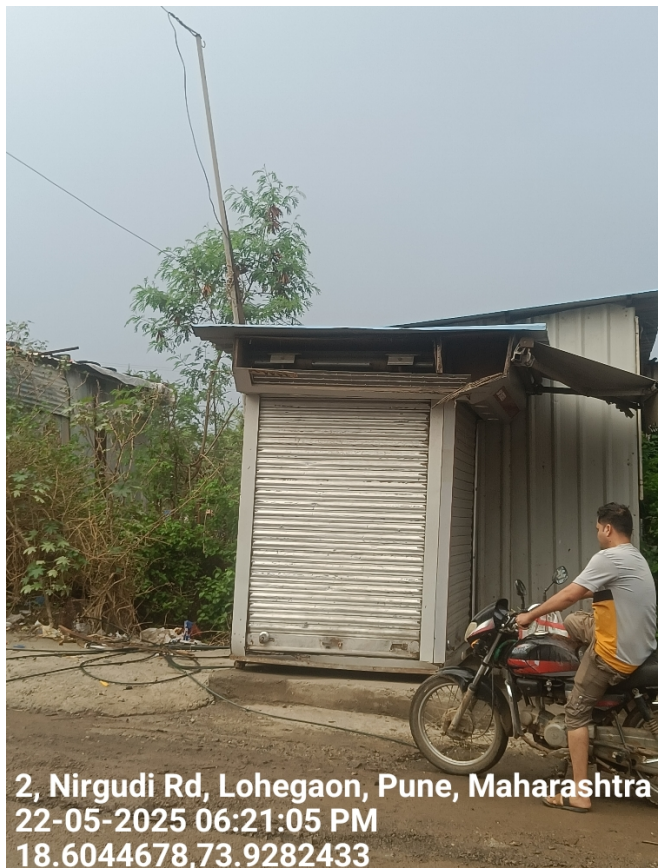
2, Nirgudi Rd, Lohegaon, Pune, Maharashtra 22-05-2025 06:21:05 PM 18.6044678,73.9282433

Shop inside with inventory photos establishing that the inside is of the same shop where the front photo was taken