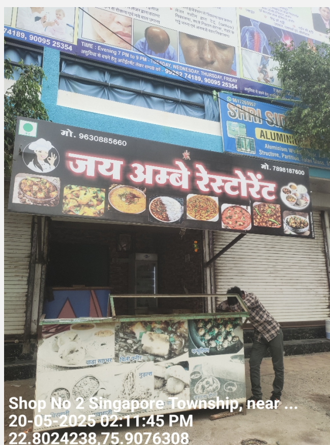
Shop No 2 Singapore Township, near ... 20-05-2025 02:11:45 PM 22.8024238,75.9076308

Shop front photo with full vertical viewpoint i.e; shop board, sealing, entrance, ground on which the shop is established (cemented, pilers, bricks, stands, mud, wheels etc.)