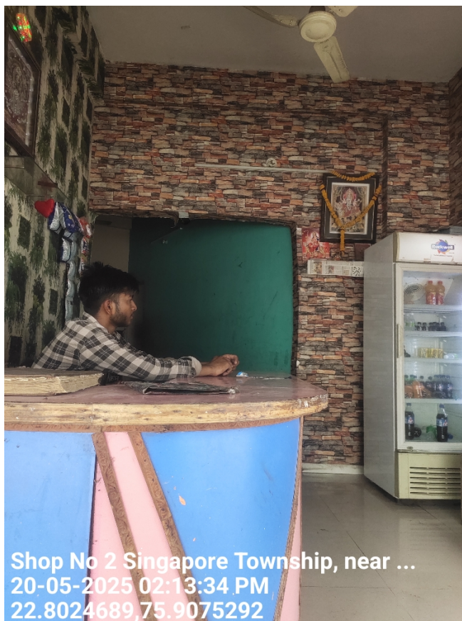
Shop No 2 Singapore Township, near ... 20-05-2025 02:13:34 PM 22.8024689,75.9075292

Take Photo of Person Met Inside the Shop