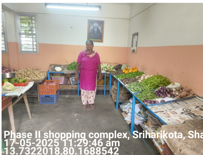
Phase II shopping complex, Sriharikota, Sha 17-05-2025 11:29:46 am 13.7322018,80.1688542

Shop inside with inventory photos establishing that the inside is of the same shop where the front photo was taken