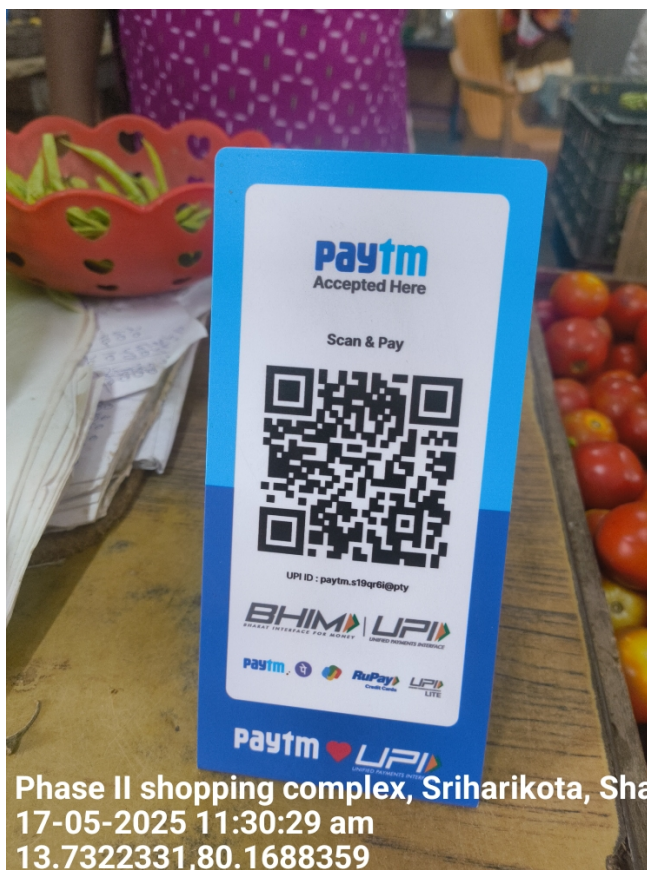
Phase II shopping complex, Sriharikota, Sha 17-05-2025 11:30:29 am 13.7322331,80.1688359

Take Photo of QR Code/Soundbox/EDC Machine