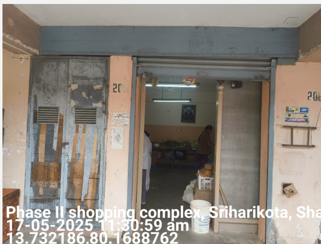
Phase II shopping complex, Sriharikota, Sha 17-05-2025 11:30:59 am 13.732186,80.1688762

Shop front with horizontal view covering the left & right of the shop establishing if the shop is an individual structure, in a marketplace, highway, isolated place, in a cluster framework.