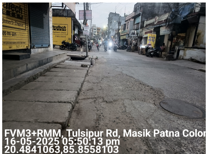
FVM3+RMM, Tulsipur Rd, Masik Patna Colony 16-05-2025 05:50:13 pm 20.4841063,85.8558103