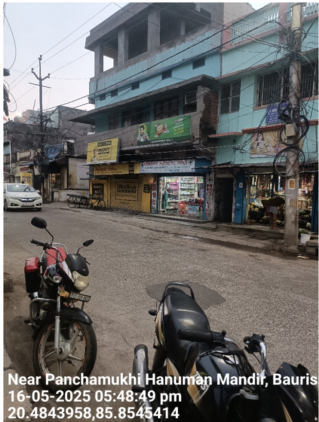
Near Panchamukhi Hanuman Mandir, Bauris 16-05-2025 05:48:49 pm 20.4843958,85.8545414