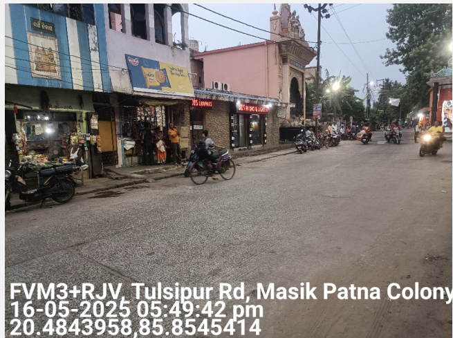
FVM3+RJV, Tulsipur Rd, Masik Patna Colony 16-05-2025 05:49:42 pm 20.4843958,85.8545414