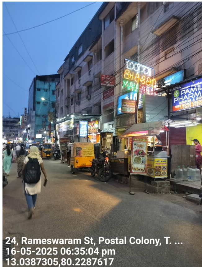
24, Rameswaram St, Postal Colony, T ... 16-05-2025 06:35:04 pm 13.0387305,80.2287617