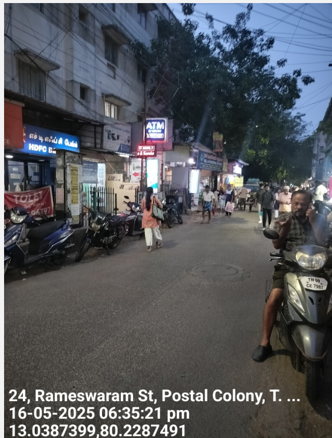
24, Rameswaram St, Postal Colony, T ... 16-05-2025 06:35:21 pm 13.0387399,80.2287491