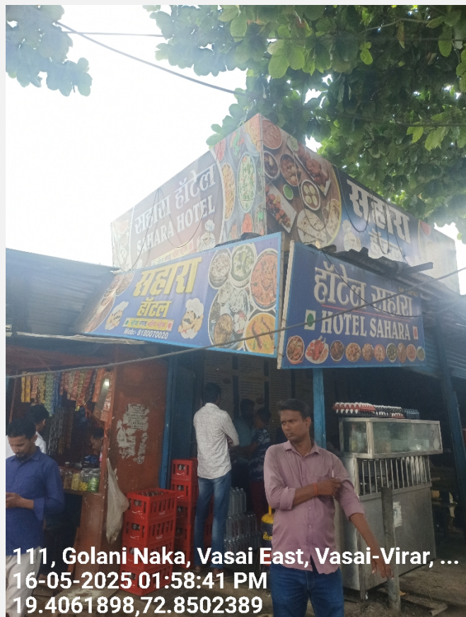
111, Golani Naka, Vasai East, Vasai-Virar, ... 16-05-2025 01:58:41 PM 19.4061898,72.8502389

Shop front with horizontal view covering the left & right of the shop establishing if the shop is an individual structure, in a marketplace, highway, isolated place, in a cluster framework.