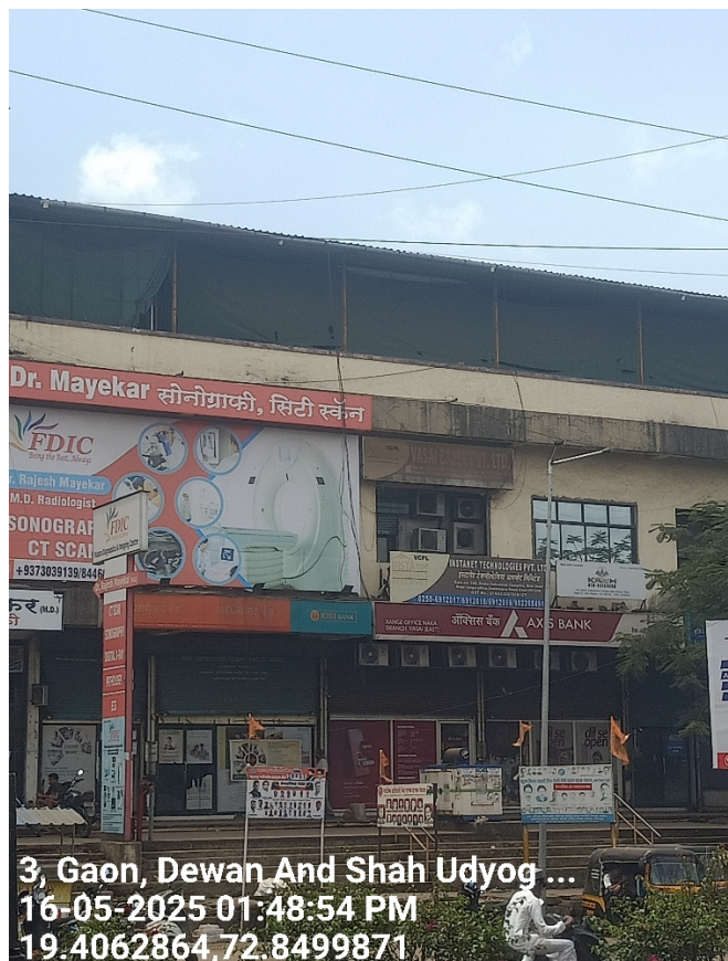
3, Gaon, Dewan And Shah Udyog ... 16-05-2025 01:48:54 PM 19.4062864,72.8499871

Shop inside with inventory photos establishing that the inside is of the same shop where the front photo was taken