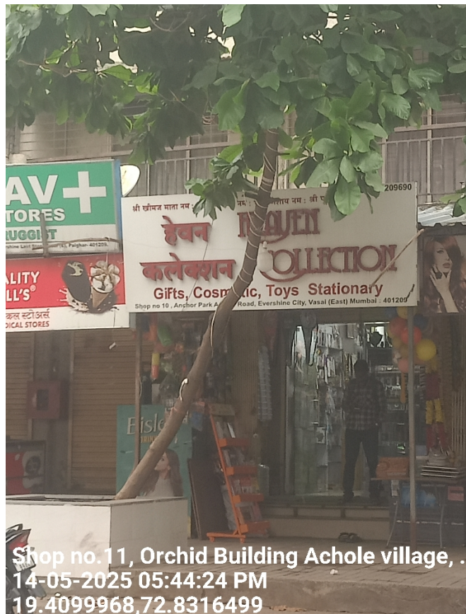
Shop no.11, Orchid Building Achole village, . 14-05-2025 05:44:24 PM 19.4099968,72.8316499

Shop inside with inventory photos establishing that the inside is of the same shop where the front photo was taken