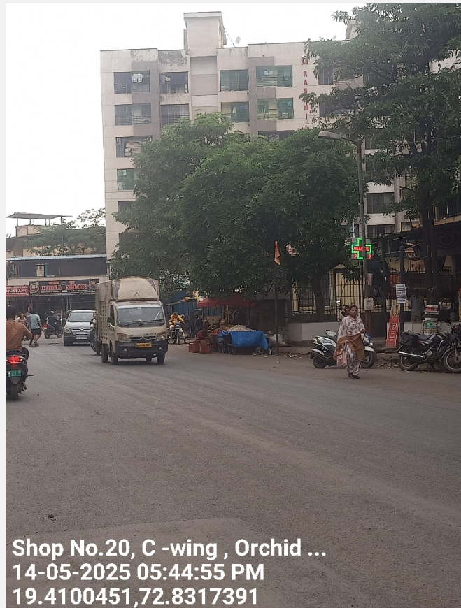
Shop No.20, C -wing , Orchid ... 14-05-2025 05:44:55 PM 19.4100451,72.8317391

Shop front with horizontal view covering the left & right of the shop establishing if the shop is an individual structure, in a marketplace, highway, isolated place, in a cluster framework.