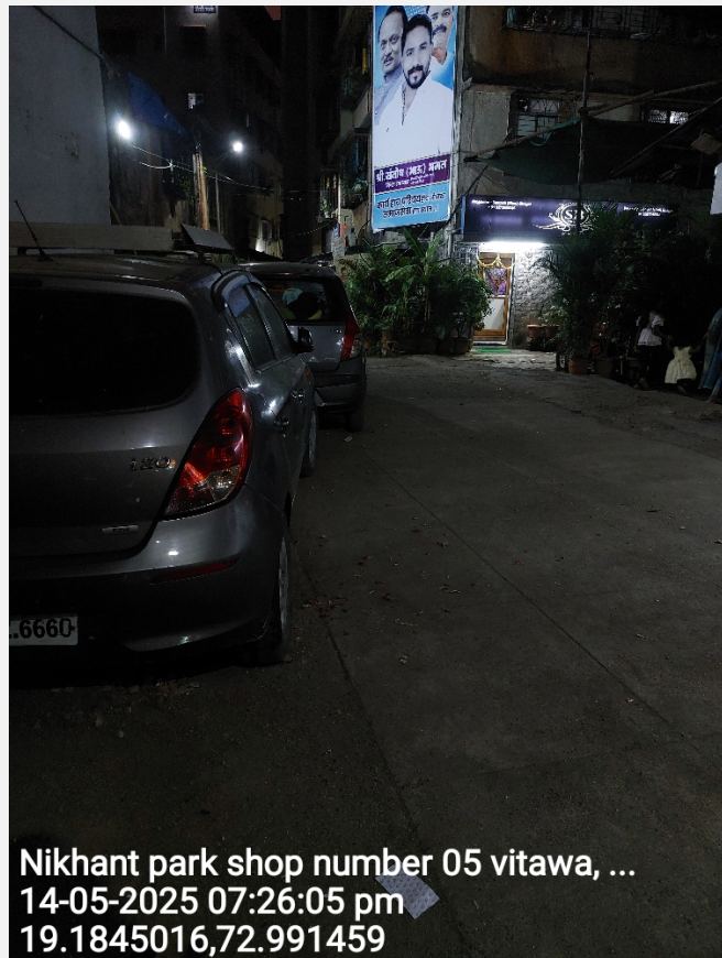
Nikhant park shop number 05 vitawa, ... 14-05-2025 07:26:05 pm 19.1845016,72.991459

Shop front with horizontal view covering the left & right of the shop establishing if the shop is an individual structure, in a marketplace, highway, isolated place, in a cluster framework.