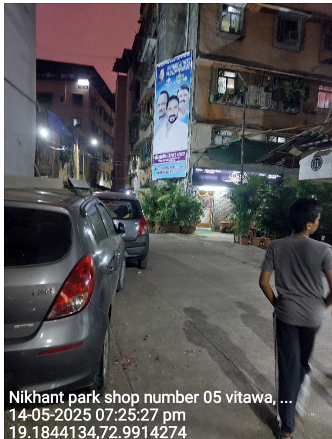
Nikhant park shop number 05 vitawa, ... 14-05-2025 07:25:27 pm 19.1844134,72.9914274

Shop inside with inventory photos establishing that the inside is of the same shop where the front photo was taken