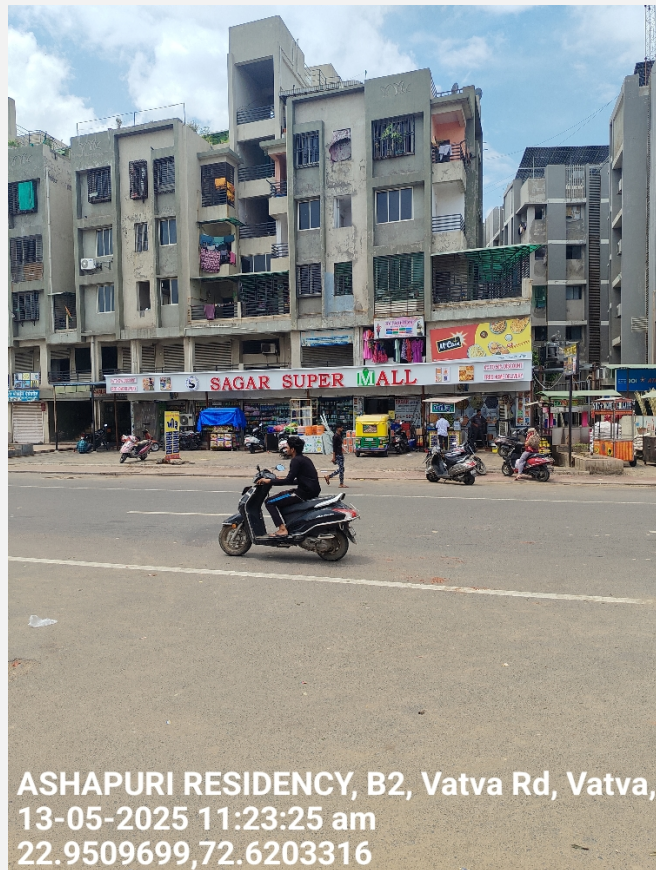
ASHAPURI RESIDENCY, B2, Vatva Rd, Vatva, 13-05-2025 11:23:25 am 22.9509699,72.6203316