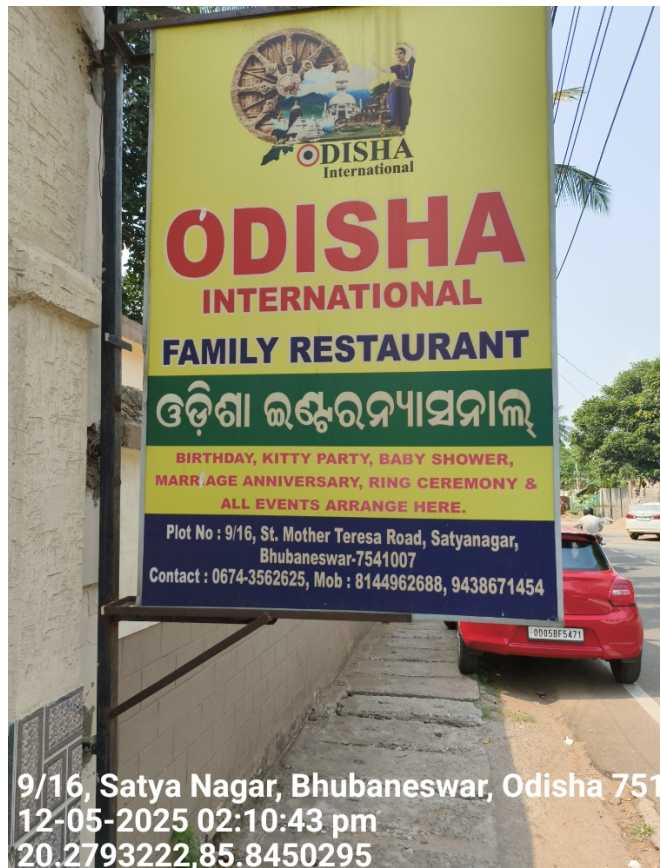
9/16, Satya Nagar, Bhubaneswar, Odisha 751 12-05-2025 02:10:43 pm 20.2793222,85.8450295

Shop inside with inventory photos establishing that the inside is of the same shop where the front photo was taken