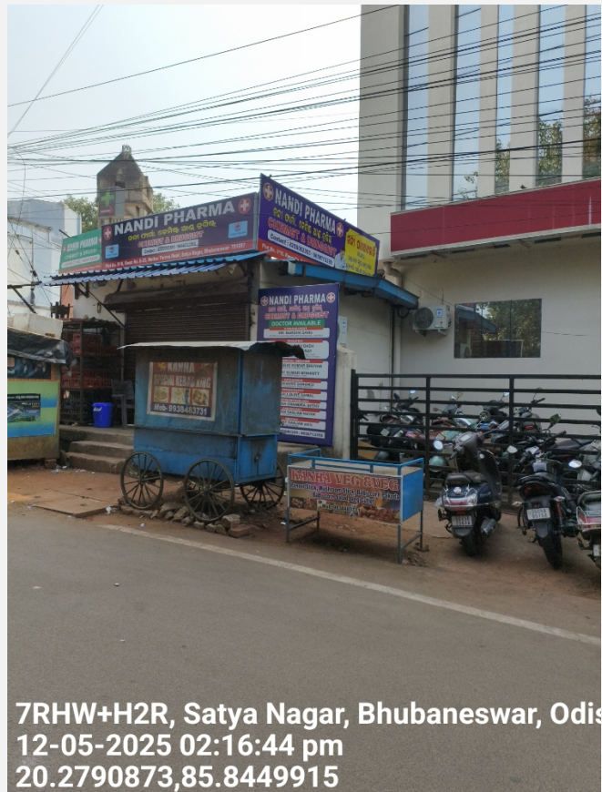
7RHW+H2R, Satya Nagar, Bhubaneswar, Odisha 12-05-2025 02:16:44 pm 20.2790873,85.8449915

Shop front with horizontal view covering the left & right of the shop establishing if the shop is an individual structure, in a marketplace, highway, isolated place, in a cluster framework.