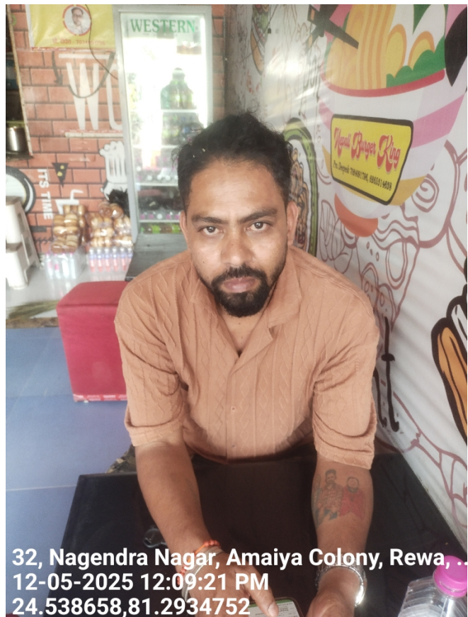
32, Nagendra Nagar, Amaiya Colony, Rewa, .. 12-05-2025 12:09:21 PM 24.538658,81.2934752

Take Photo of Person Met Inside the Shop