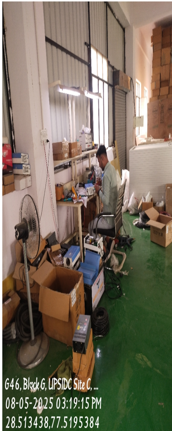
Office setup with employees