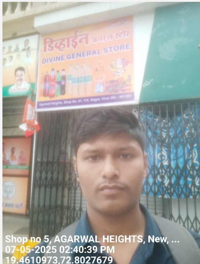
Shop no 5, AGARWAL HEIGHTS, New, ... 07-05-2025 02:40:39 PM 19.4610973,72.8027679

Take Photo of Person Met Inside the Shop