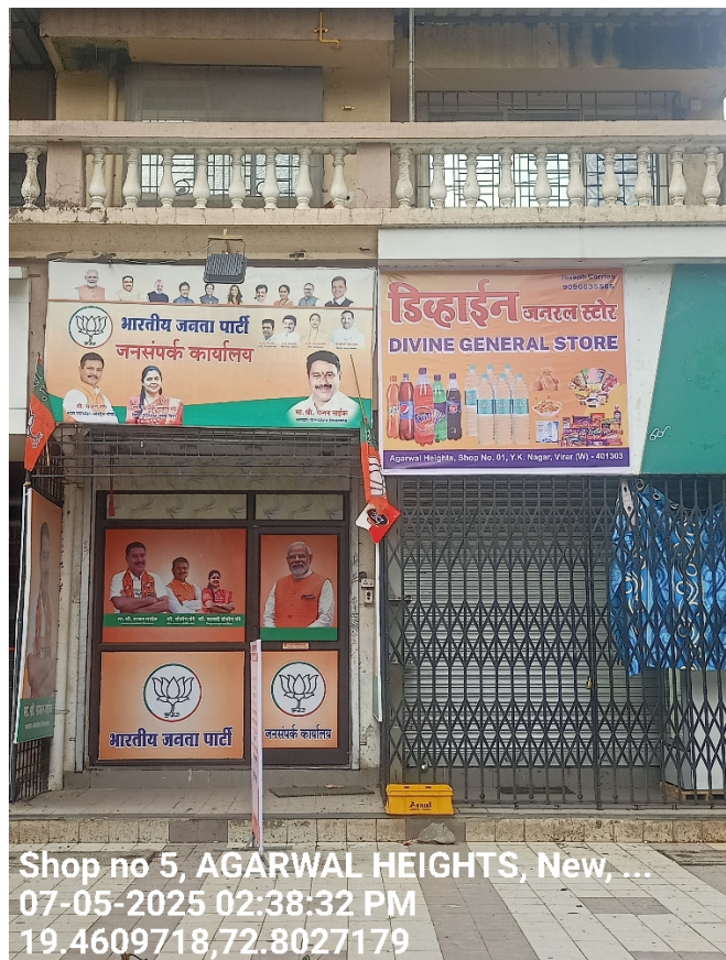
Shop no 5, AGARWAL HEIGHTS, New, ... 07-05-2025 02:38:32 PM 19.4609718,72.8027179

Shop front photo with full vertical viewpoint i.e; shop board, sealing, entrance, ground on which the shop is established (cemented, pilers, bricks, stands, mud, wheels etc.)