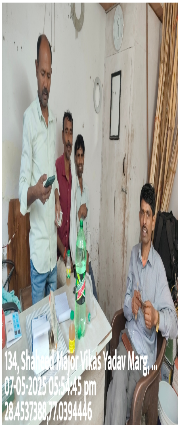
Office setup with employees