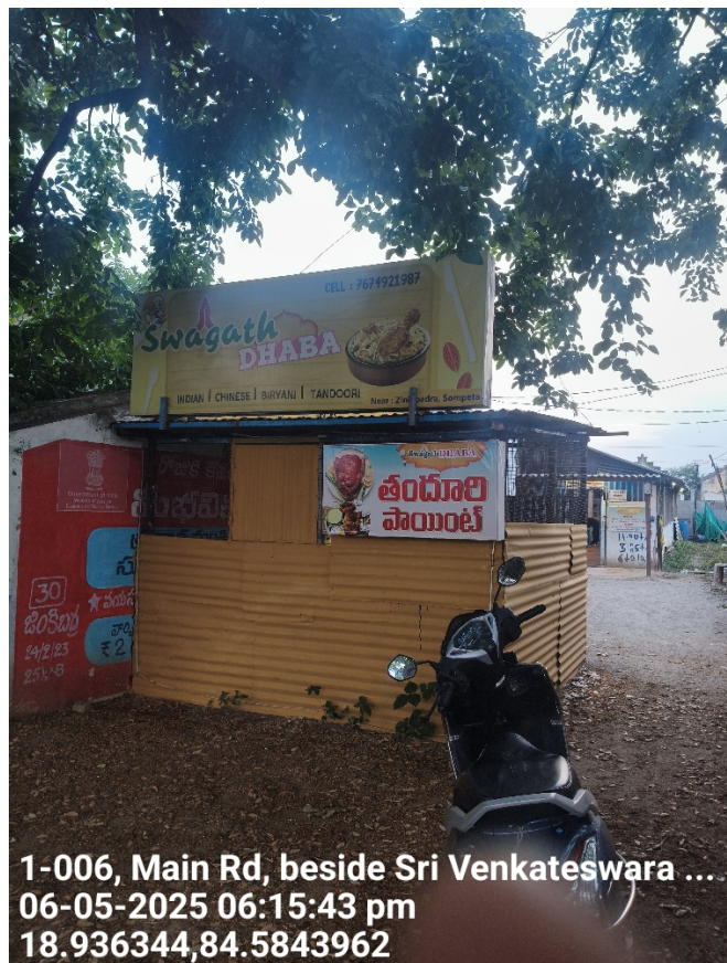
1-006, Main Rd, beside Sri Venkateswara ... 06-05-2025 06:15:43 pm 18.936344,84.5843962

Shop front with horizontal view covering the left & right of the shop establishing if the shop is an individual structure, in a marketplace, highway, isolated place, in a cluster framework.