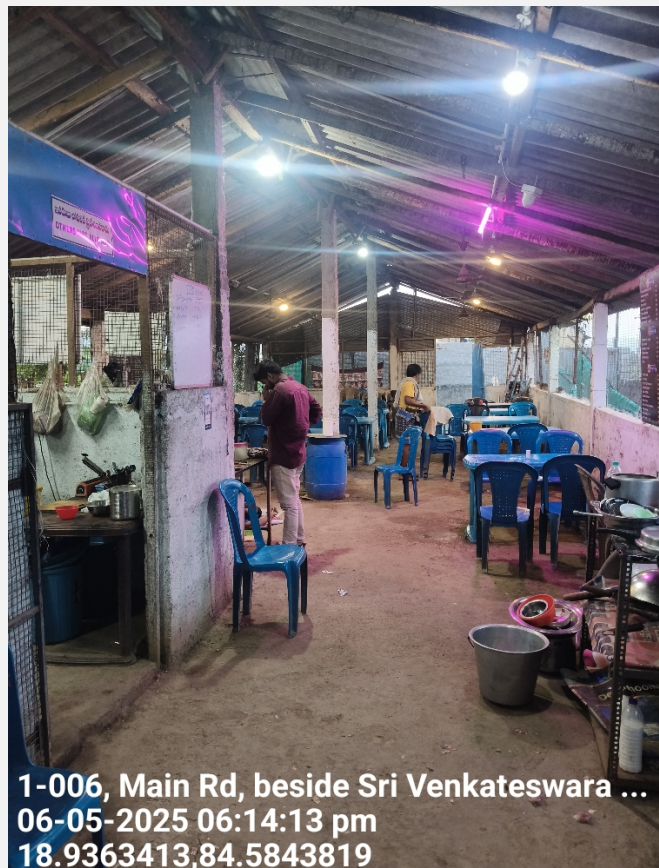
1-006, Main Rd, beside Sri Venkateswara ... 06-05-2025 06:14:13 pm 18.9363413,84.5843819

Shop inside with inventory photos establishing that the inside is of the same shop where the front photo was taken