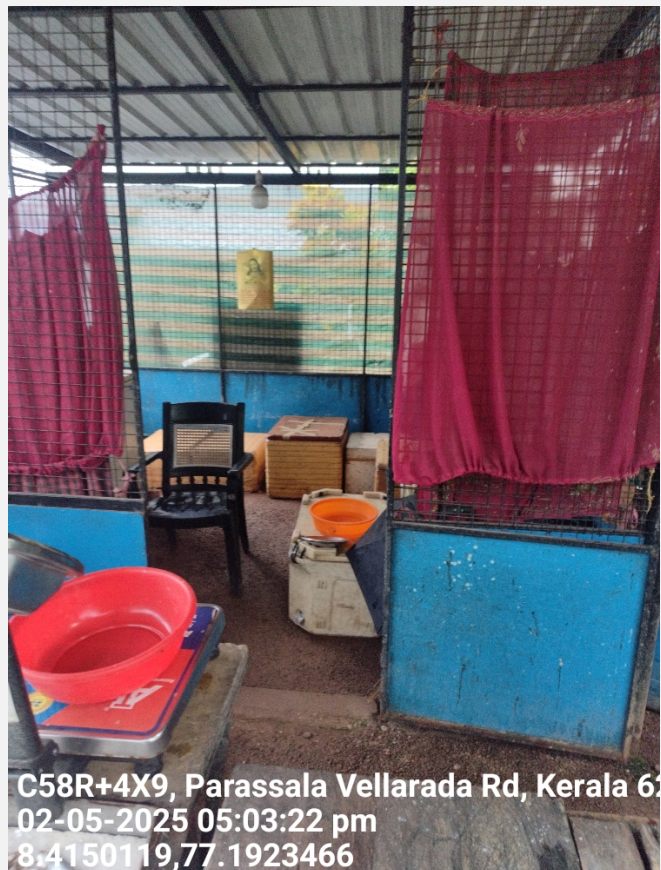
C58R+4X9, Parassala Vellarada Rd, Kerala 61 02-05-2025 05:03:22 pm 8.4150119,77.1923466

Shop inside with inventory photos establishing that the inside is of the same shop where the front photo was taken