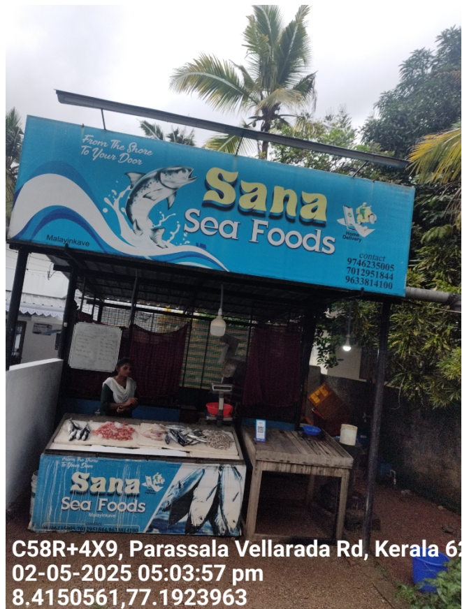
C58R+4X9, Parassala Vellarada Rd, Kerala 61 02-05-2025 05:03:57 pm 8.4150561,77.1923963

Shop front with horizontal view covering the left & right of the shop establishing if the shop is an individual structure, in a marketplace, highway, isolated place, in a cluster framework.