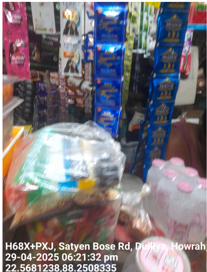
H68X+PXJ, Satyen Bose Rd, Duillya, Howrah 29-04-2025 06:21:32 pm 22.5681238,88.2508335

Shop inside with inventory photos establishing that the inside is of the same shop where the front photo was taken