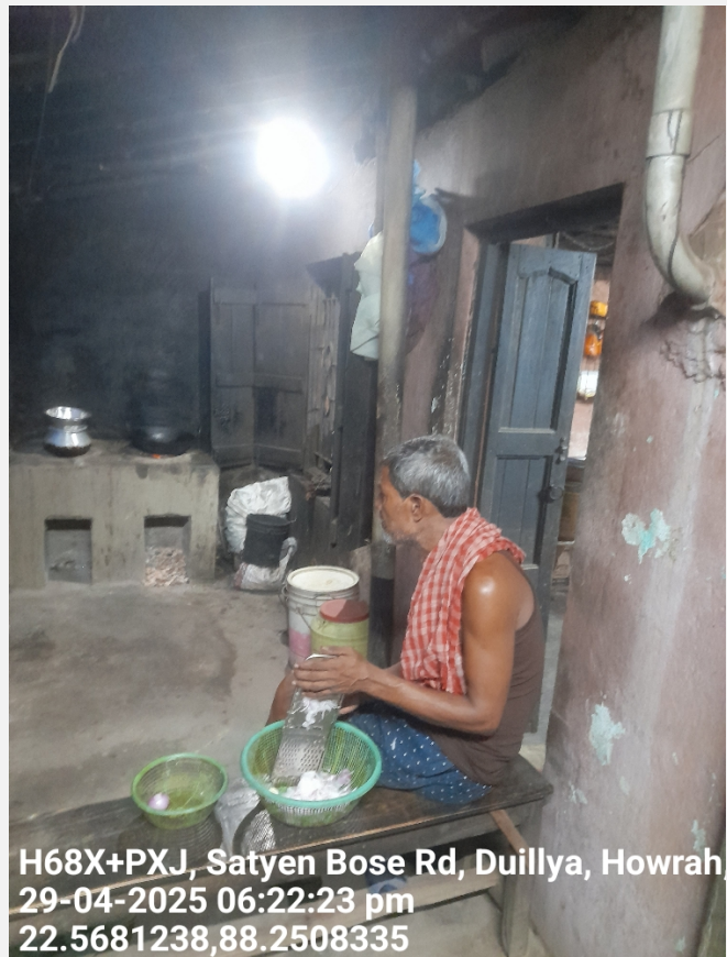
H68X+PXJ, Satyen Bose Rd, Duillya, Howrah 29-04-2025 06:22:23 pm 22.5681238,88.2508335

Shop front with horizontal view covering the left & right of the shop establishing if the shop is an individual structure, in a marketplace, highway, isolated place, in a cluster framework.