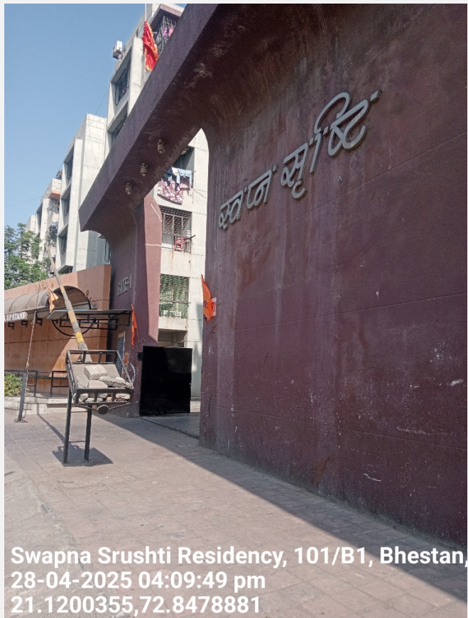
Swapna Srushti Residency, 101/B1, Bhestan, 28-04-2025 04:09:49 pm 21.1200355,72.8478881